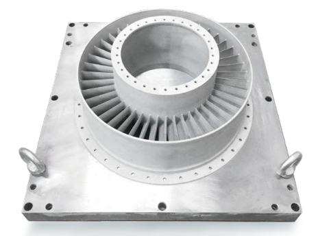
Engine turbine casing assembly IN718 high temperature alloy \phi 410*240mm<sup>3</sup>