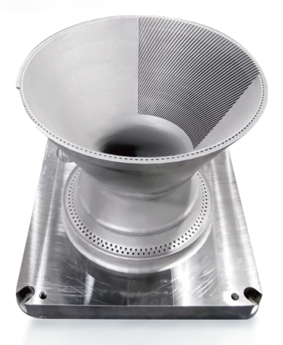
TC4 titanium alloy $$\phi 393*340mm^3$