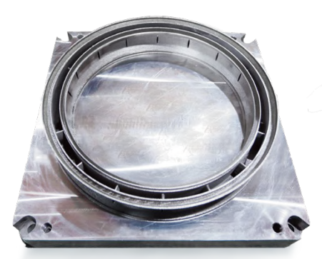
Engine leaf ring structure 316L stainless steel $400*60mm3