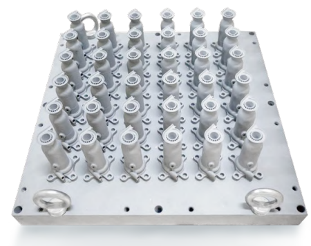
Multi–oil pipeline assembly parts IN718 high temperature alloy 420*420*110 mm<sup>3</sup>

With a building chamber size of 456 x 456 x 1080 mm<sup>3</sup>. Eplus3D Introduces EP–M450H to the successful line of MPBF<sup>™</sup> 3D printers. The new EP–M450 is a marvelous metal printer that makes the production of reliable and high quality large metallic parts viable on industrial scale without requiring any tools.